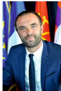
Michaël Delafosse Montpellier's mayor Montpellier Méditerranée Métropole's president

Counting on your cooperation to respect the safety instructions, we wish you a pleasant stroll in one of Montpellier's largest greenery!